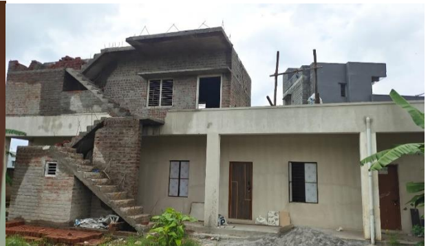
RENOVATED BOYS HOSTEL

CELEBRATED SAMVIDHAN DIVAS (CONSTITUTION DAY) AT SANDEEP SEVA NILAYAM ON 26 TH NOVEMBER 2021