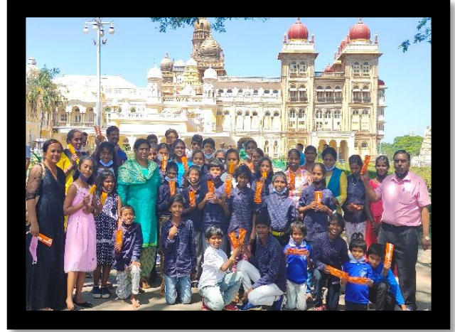
One day Education tour organised for our child care institution children