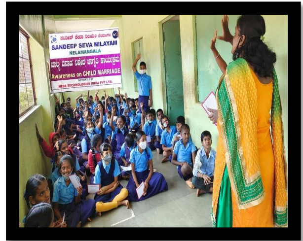
Awareness on Child marriage and Missing children for the School Children supported by NESS TECHNOLOGIES INDIA PVT.LTD.

Registered Office Address: Sandeep Seva Nilayam Near Benaka Layout, Obanayakanahalli Road, Nelamangala Bangalore Rural Dist.562123