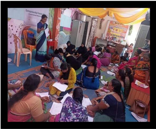
EDP training conducted for the SHG Group women